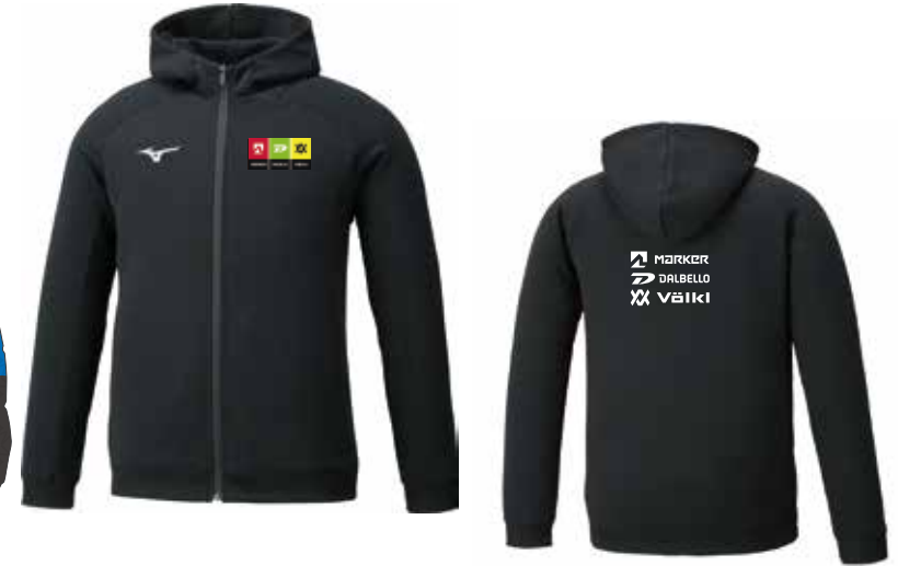
⑳ Z2MC0177 C/#09 Sweat Hoodie