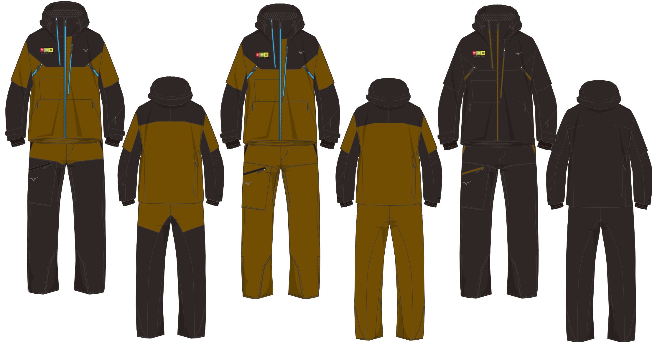
②PANTS // Z2MF1341 C/# 95